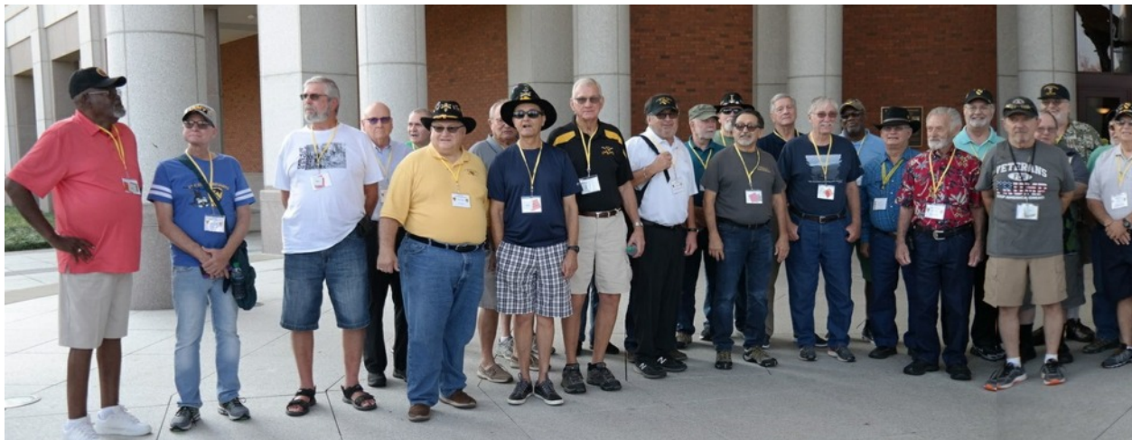
D Company, 1st Battalion, 12th Cavalry, 1st Cavalry Division