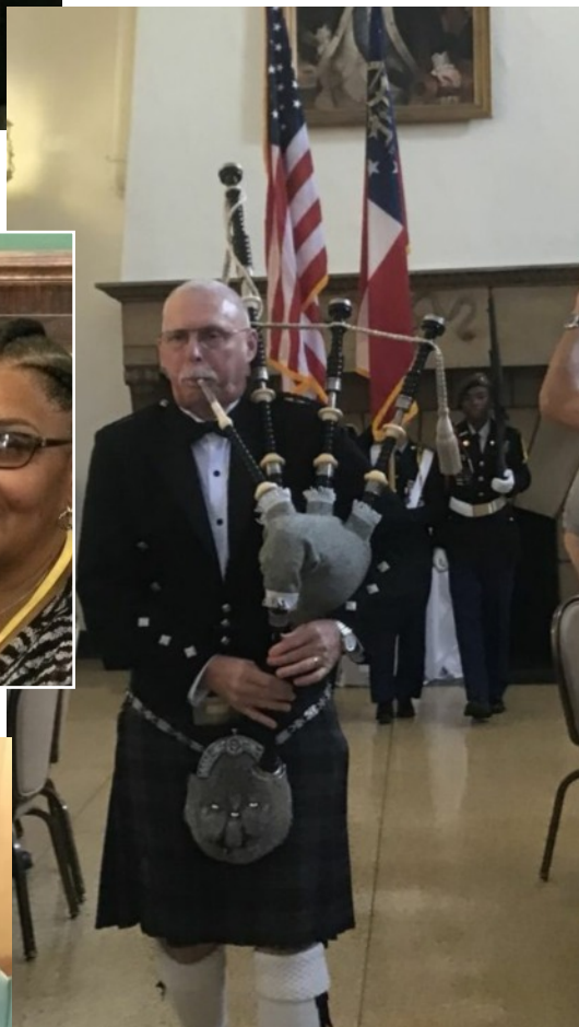
Piping in the Colors to "Garryowen" is a tradition at Delta's Reunions