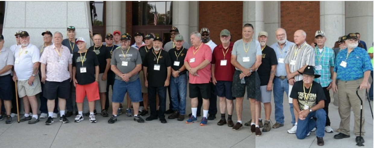
Vietnam Veterans at the National Infantry Museum